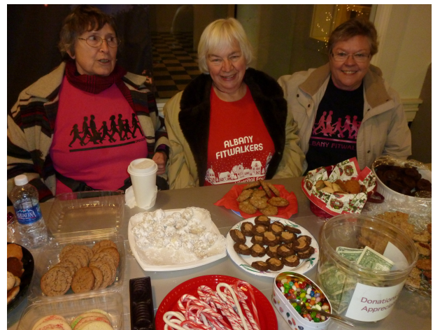
Christmas Walk Workers