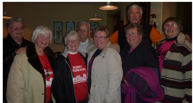
Ping Party after the Walk